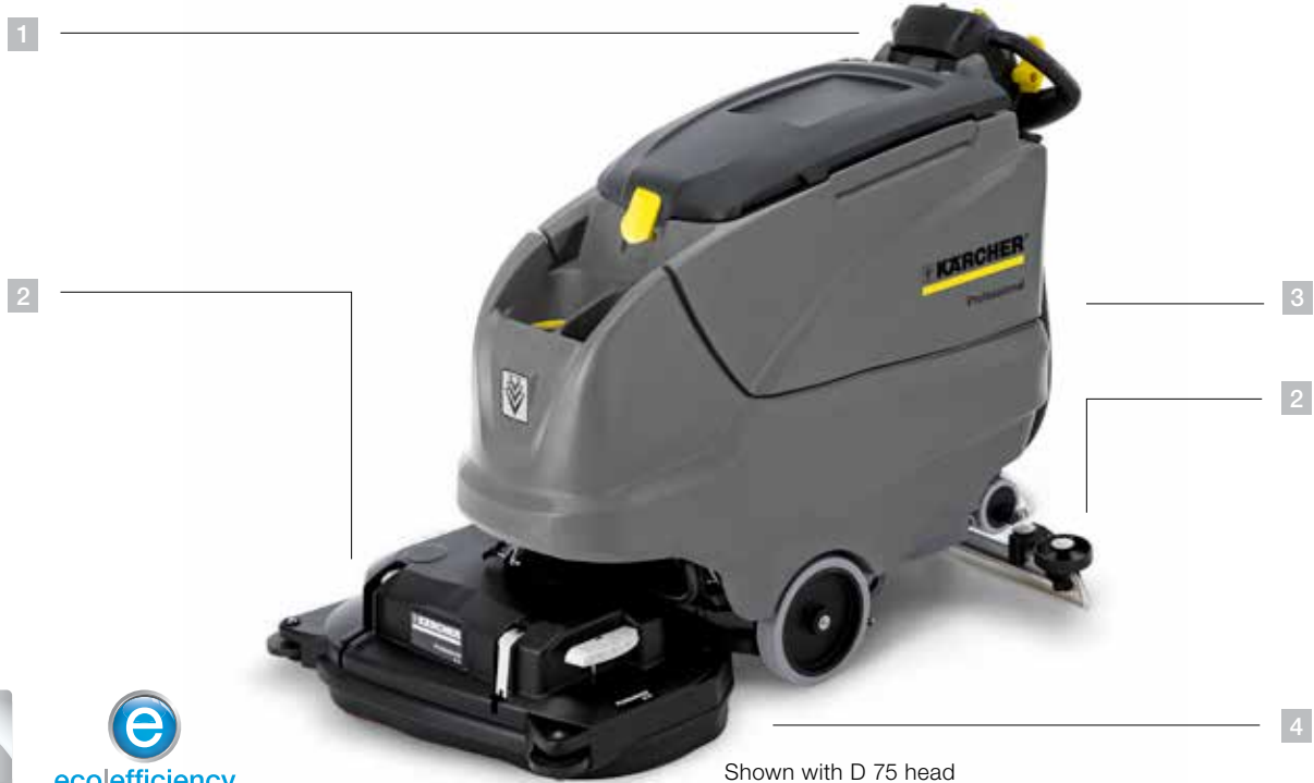
Shown with D 75 head

With a robust and maintenance-friendly brush head, the B 80 is available with roller or disc brushes in 22", 26" and 30" working widths. Equipped with KIK, a new 4-color display and automatic lowering and lifting of the cleaning head and squeegee, cleaning large areas is now easier.